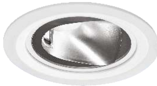
Available Reflector Deg.