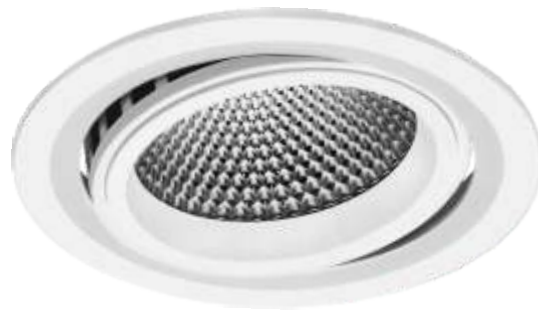
Available Reflector Deg.